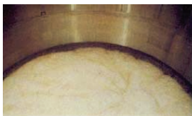
No Foamsol – 31 hrs