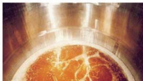
Foamsol 4ml/hl – 20hrs