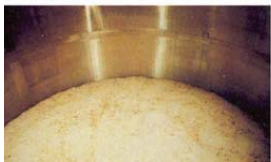
No Foamsol – 20 hrs

Alternatively, Foamsol can be added to the kettle, where a higher addition rate may be required, or to the surface of the fermenting beer via the CIP system.