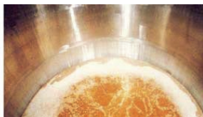
Foamsol 4ml/hl – 31hrs